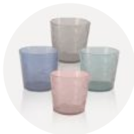
TUMBLER standard color MOQ 500 pieces